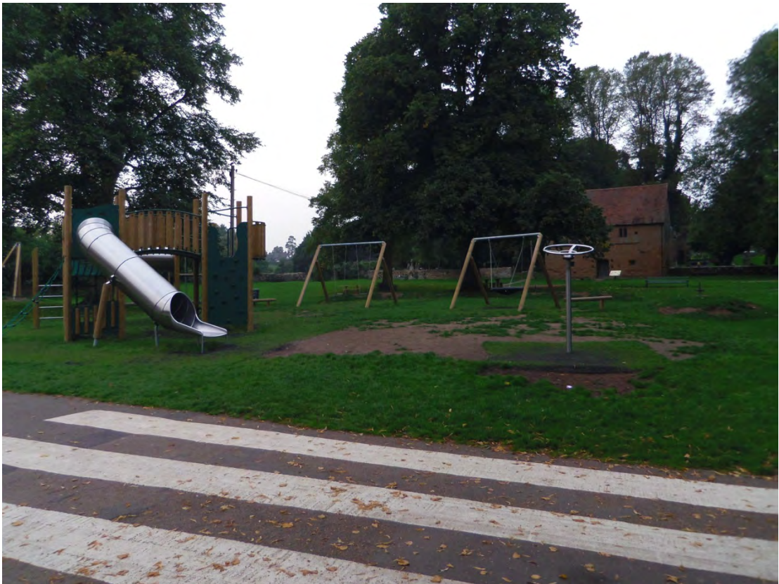
Fig 7: Northern part of play area