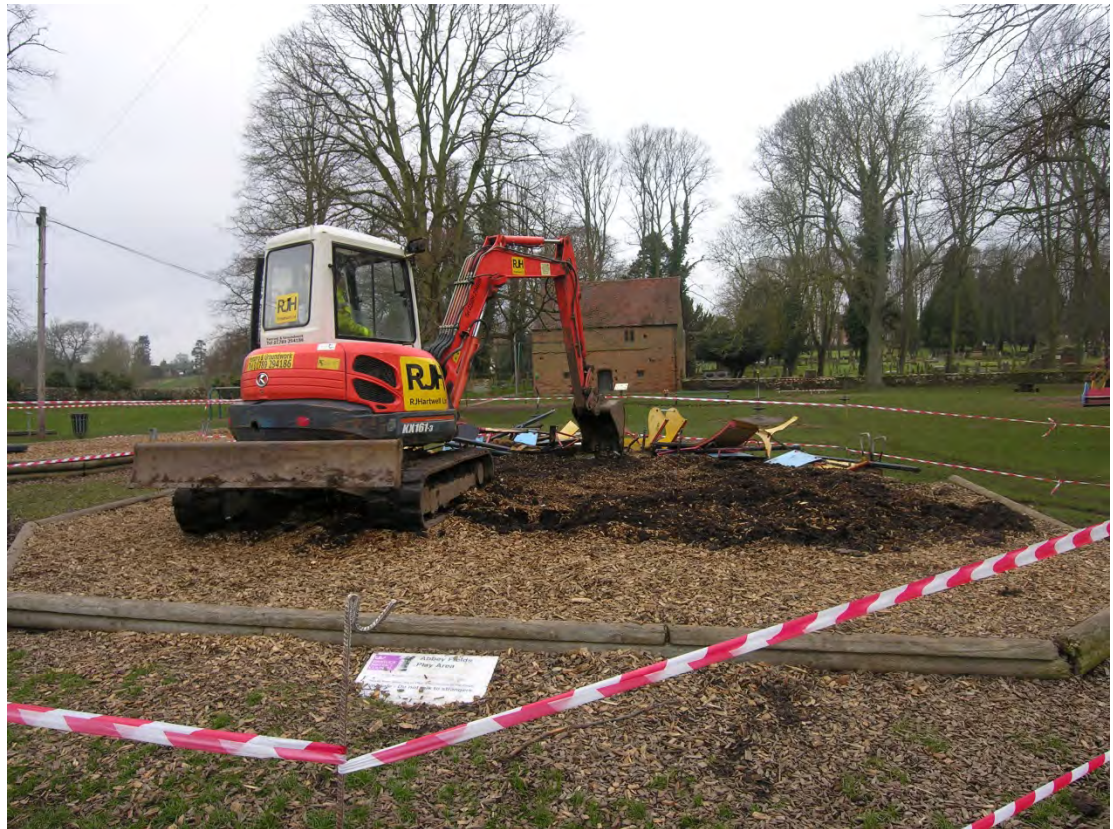
Fig 4: Play equipment removal