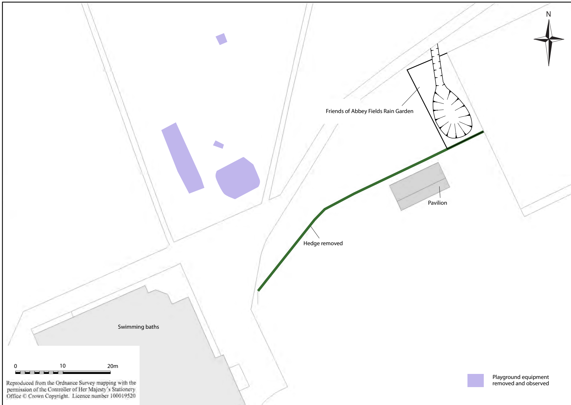
Fig 2: Areas and trenches observed