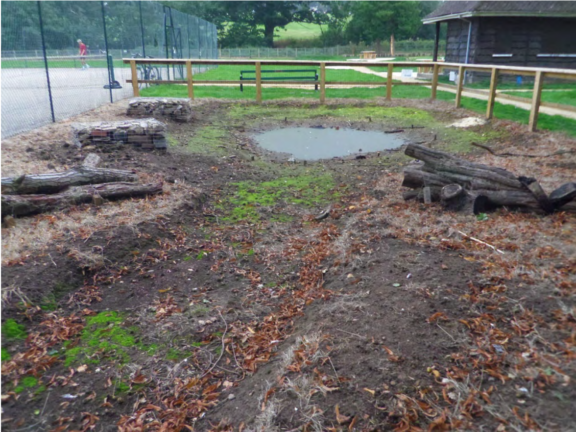
Fig 8: 'Rain Garden'