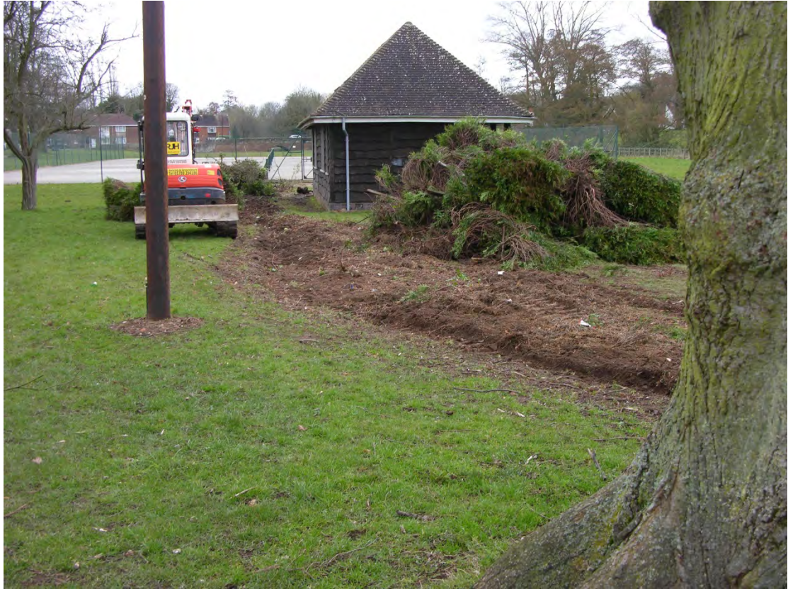
Fig 3: Hedge removal