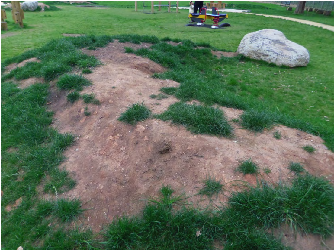
Fig 9: Erosion of one of the mounds