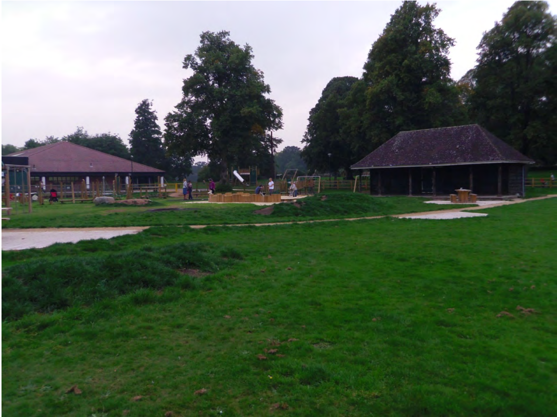
Fig 6: Play area