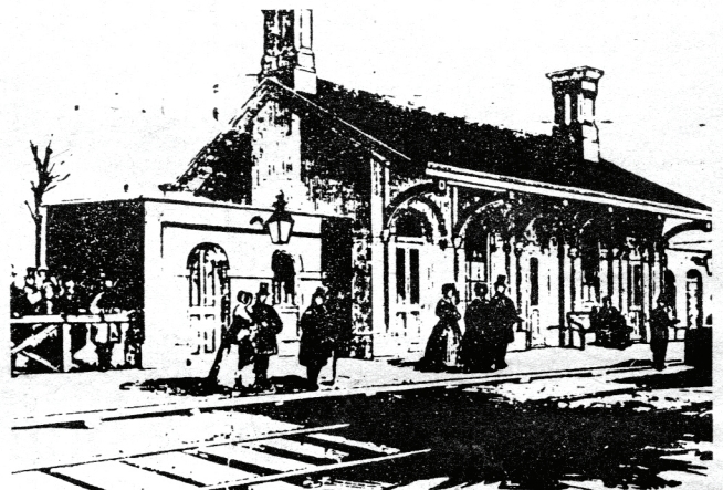
The first station — built 1844 and moved 1883

It was taken down and rebuilt says Robin